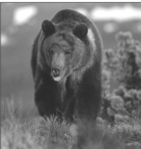
H.B. 629 would have prohibited bear hunting but was killed in committee.

H.B. 629 included a six-year moratorium on hunting bears and called for a scientific population study during the fifth year so that accurate information would be available to guide state policy. Current estimates are that just 250 to 450 black bears live in Maryland, although the MDNR has admitted that the actual population numbers are unknown. Even a limited hunt could cause irreparable damage and jeopardize the survival of such a small population. Black bears are already at risk due to development and habitat fragmentation and intensive hunting in bordering states, in addition to being among the slowest mammals to reproduce. Based on public comments on the Black Bear Task Force report, Maryland citizens are against a trophy bear hunt by a 5 to 1 ratio.